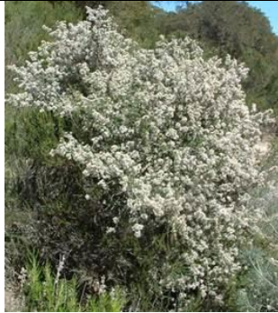
Ceanothus cuneatus (Waxleaf Ceanothus)