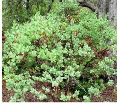
Arctostaphylos catalinae (Catalina Island Manzanita)