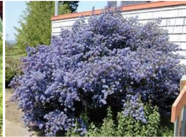
Ceanothus species (Lilac)