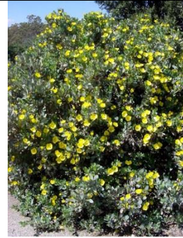
Dendromecon harfordii (Channel Island Tree Poppy)