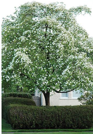
Cornus nuttallii (Mountain Dogwood)