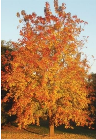
Acer negundo var. californicum (California Box Elder)