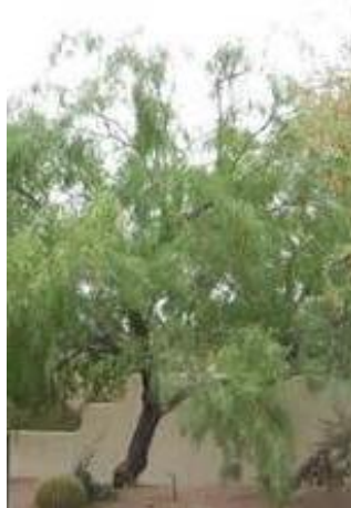
Prosopis glandulosa (Mesquite)