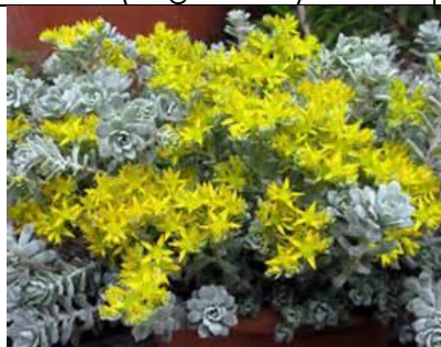
Sedum (Pacific Stonecrop)