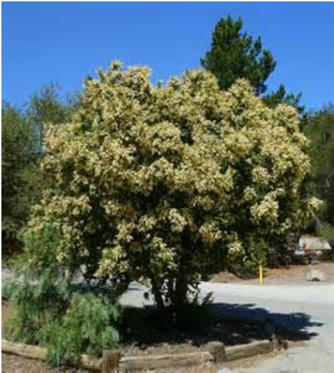
Prunus ilicifolia (Holly-Leaved Cherry)