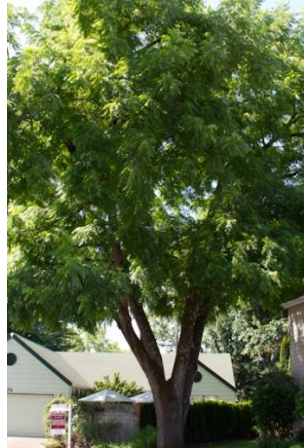
Juglans californica (So Ca. Black Walnut)