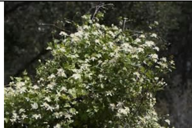
Clematis lasiantha (Chaparral Clematis)