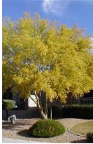
Cercidium floridum (Blue Palo Verde)