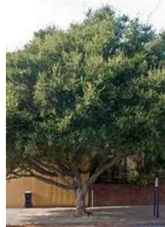
Quercus agrifolia (Coast Live Oak)