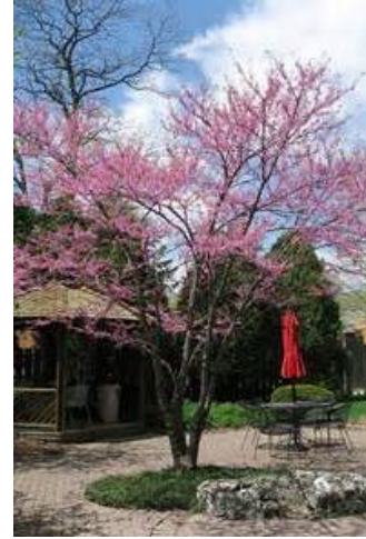
Cercis occidentalis (Western Redbud)