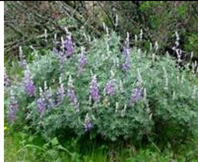
Lupinus albifrons (Silver Bush Lupine)