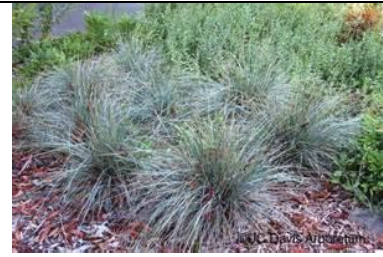
Festuca californica (California Fescue)