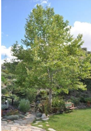
Platanus racemosa (California Sycamore)