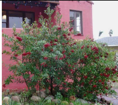
Heteromeles arbutifolia (Toyon)