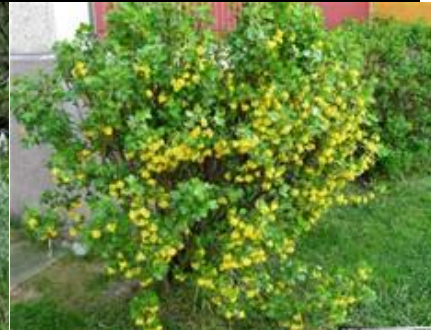
Ribes aureum (Golden Currant)